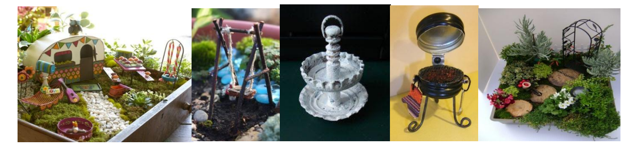
Furniture can be made or bought. Wood, metal wire, clay even fabric hammocks

Garden features and ornaments can be made [the bbq and white feature are made from bottle tops]like play equipment, or small trinkets used, like the wheelbarrow and arch or the guitar and props in the caravan garden. How about a washing line, bunting, statues or picnic.